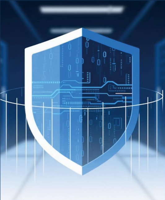
Enterprise-grade encryption, data isolation, hybrid cloud or private deployment options.

Personal Workstation and Standard Edition coming out soon, suitable for smaller scale applications.