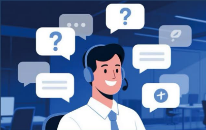
Dedicated Technical Support