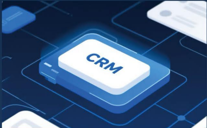
Seamless Integration with CRM tools and more