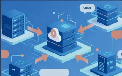
Flexible Deployment Options