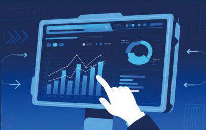
Custom Demo & Pilot Program available